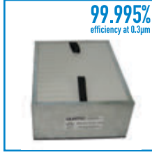
6" HEPA Filter F475