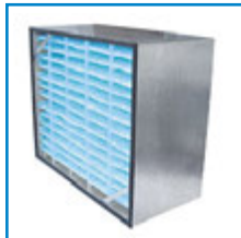
12" Deep Pleat Filter F014