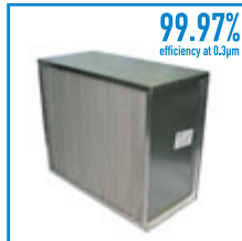
12" HEPA Filter F052