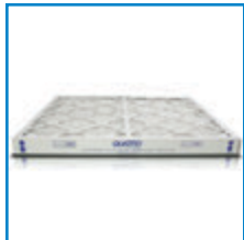
2" Pleated Filter F001