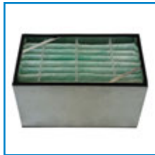
12" Deep Pleat Filter F015