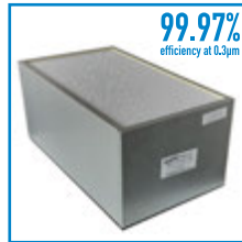
9" HEPA Filter F550